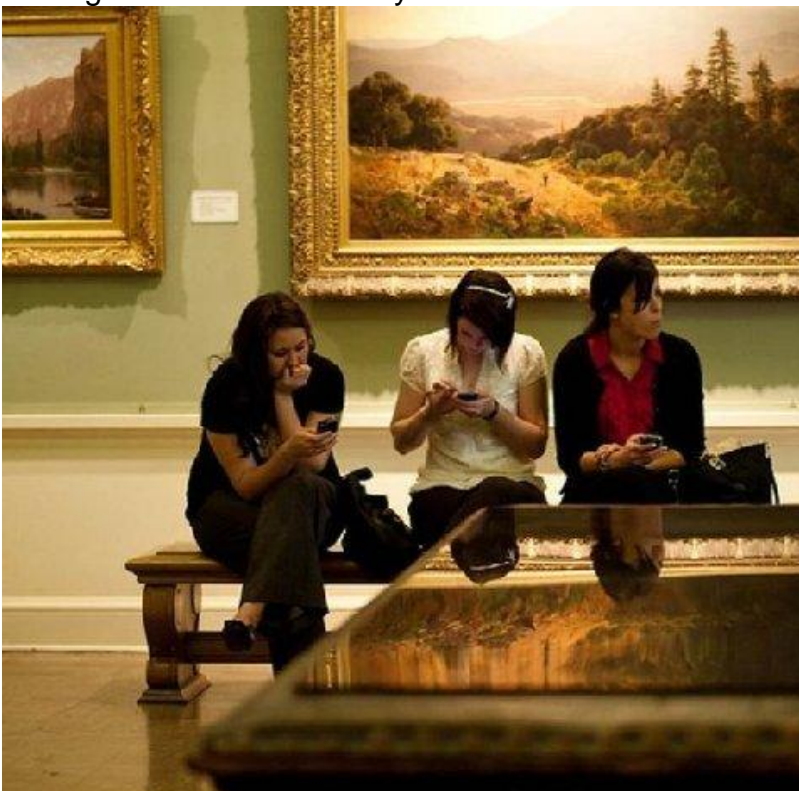
A visit to the museum