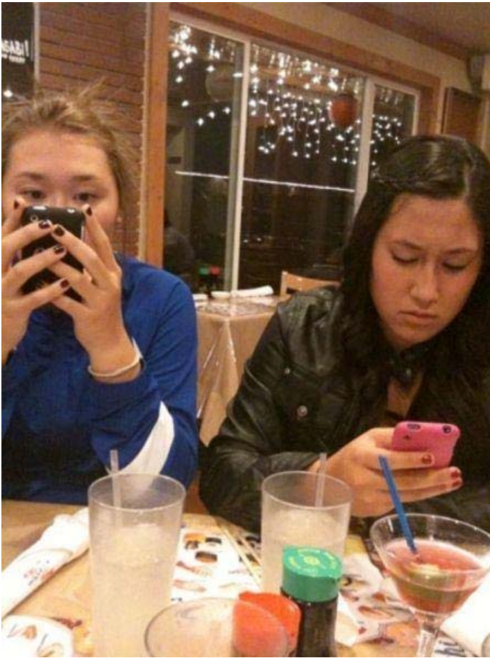
Having a conversation with your BFF