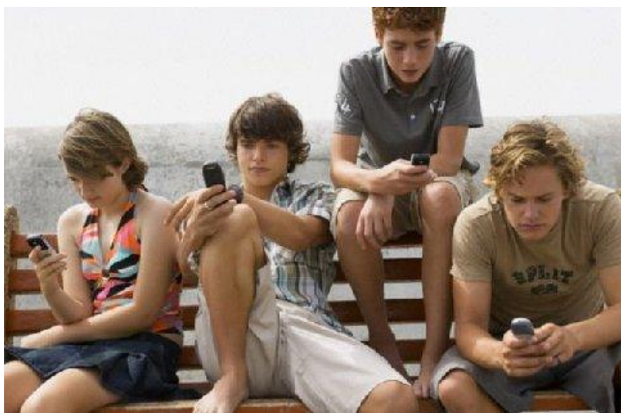
A day at the beach.