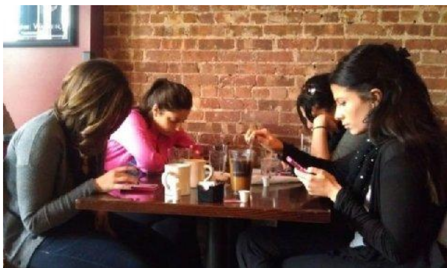
Having coffee with friends.

The day that Albert Einstein feared may have finally arrived.