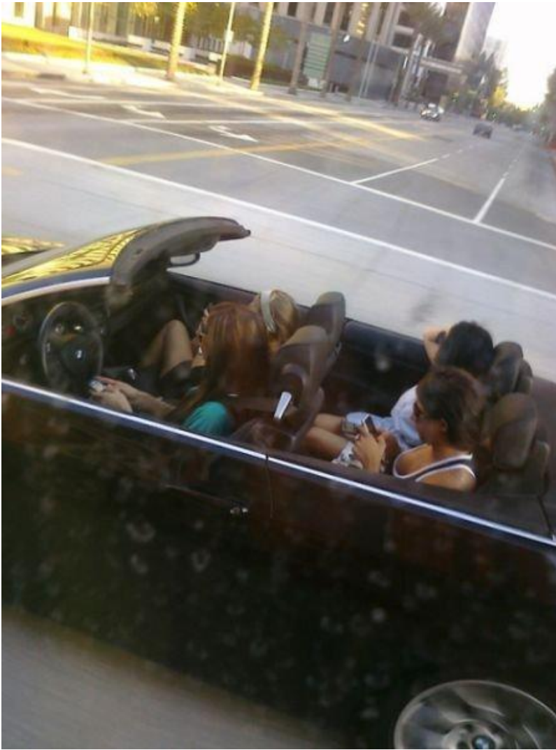
Enjoying the sights